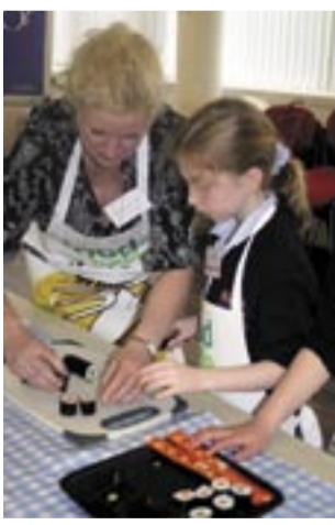
Children and teachers making sushi as part of Food for Life are afoot to fit solar panels to our roof; harnessing energy to support our hot water systems. We hope these plans will help both the environment, and Woodbrooke's finances.

groups use our site for their events. In late April a group of adults and children came to spend a day preparing and cooking food, which they then shared over lunch. Steve, our gardener, showed them the walled garden and the whole day was a real success. Alongside green groups coming to visit Woodbrooke, 2009 has also seen the first of the 'Good Lives' courses which have been so successful there are plans to re-run the first modules in 2010. Our own internal measures to be mindful of our impact on the environment have continued. At the beginning of the year, the penultimate phase of updating our antiquated heating system by installing new boilers was completed and now plans